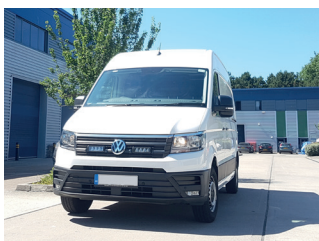
VW CRAFTER 2017+