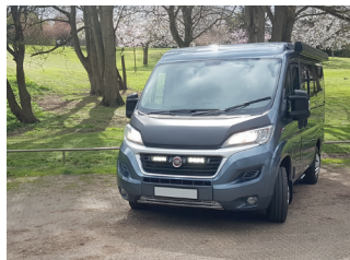
FIAT DUCATO 2014+

Thank you for choosing a Lazer Lamps product. Vielen Dank dafür, dass Sie sich für ein Produkt von Lazer Lamps entschieden haben. Merci pour choisir un produit de Lazer Lamps. Gracias por la seleccion de productos de Lazer Lamps.