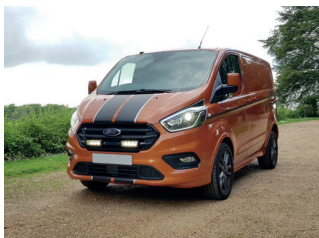
FORD TRANSIT CUSTOM 2018+