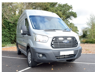
FORD TRANSIT 2015+