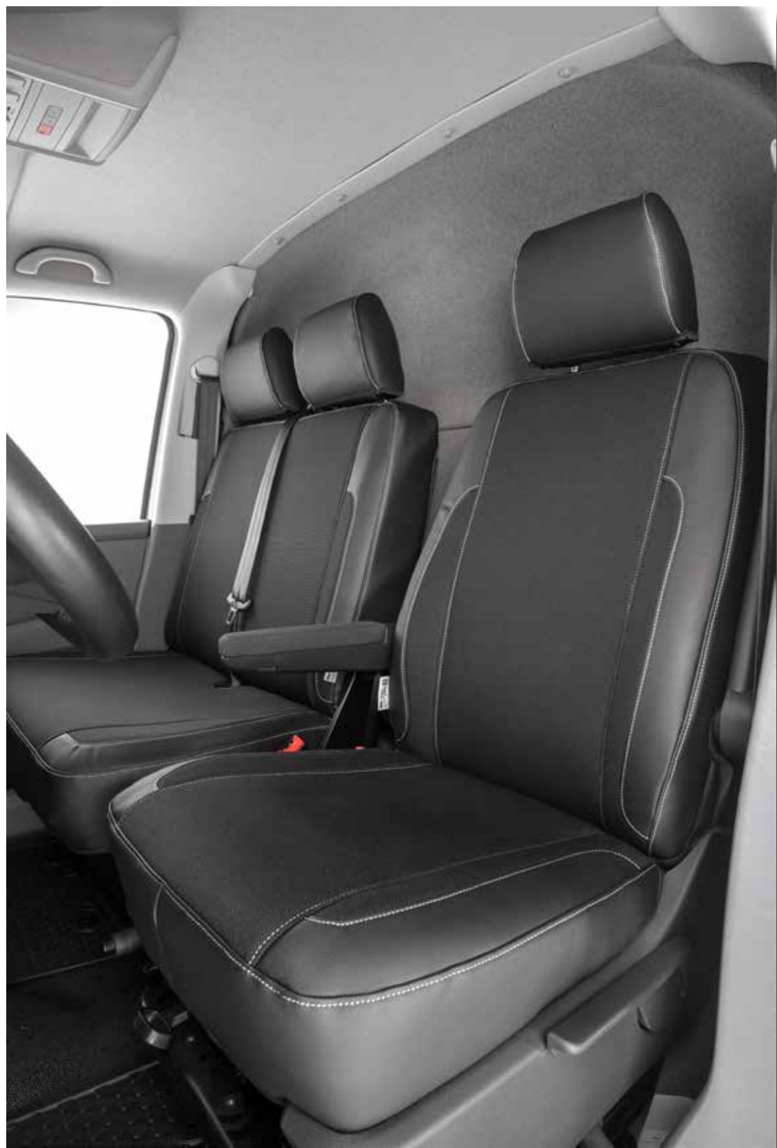
Tailor made seat cover in combination with strong fabric and artificial leather