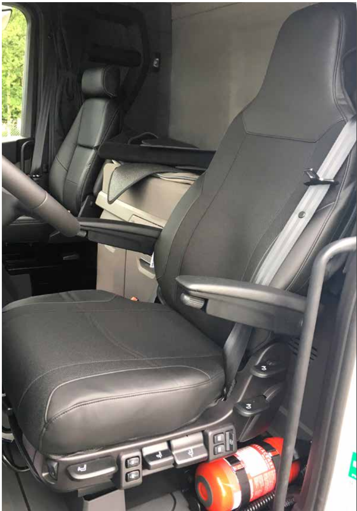
Customized solution - open sides and backside, quick and easy mounting.