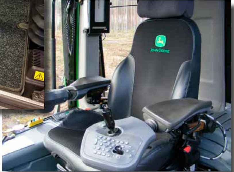
Tailor made seat cover - John Deere Forestry

There is a big collection of patterns for construction machines and tractors. The design is possible in many combinations of fabric, artificial leather and colours.