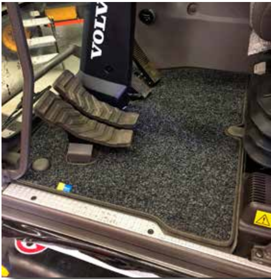
Tailor made floor mats